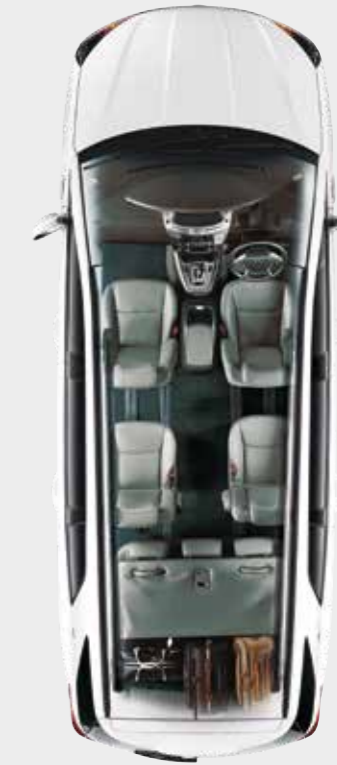
Third row seats folded