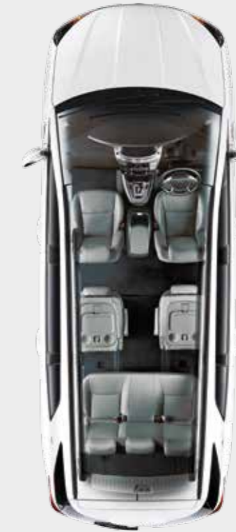
Second row seats folded