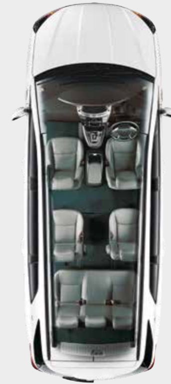
All seats facing forward