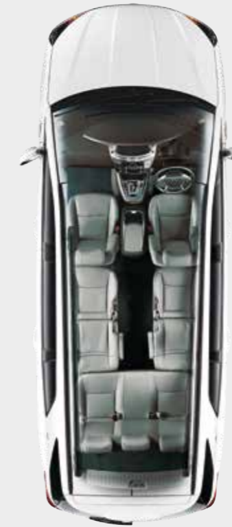
Second row seats flat