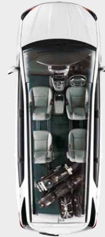
Third row seats removed