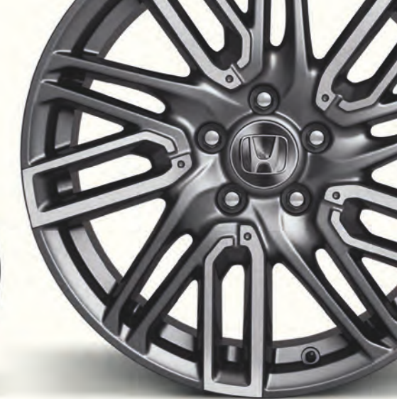
18" Fortis Alloy Wheel