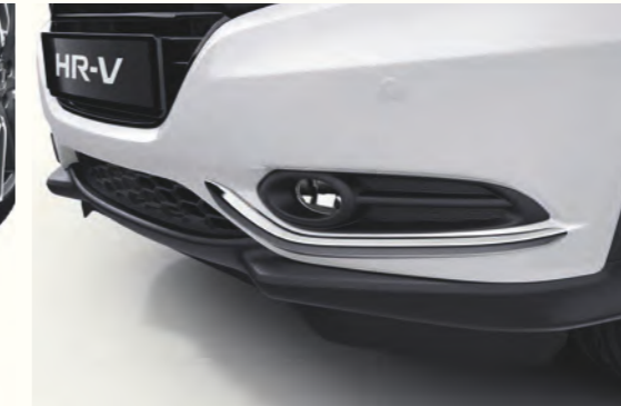
FRONT BUMPER GARNISH This chrome accessory gives the front of your car a more sophisticated appearance.