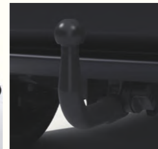
DETACHABLE TOW BAR With the detachable tow bar you can tow your caravan or trailer with a maximum towing capacity of 1,400 kg for diesel cars, 1,000 kg for petrol cars and a maximum vertical load of 70 kg. A fixed tow bar is also available.