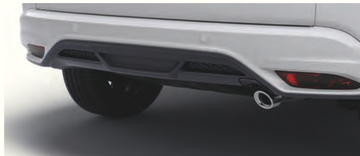
FRONT AND REAR AERO BUMPERS Enhance the dynamic looks of your car with the front and rear aero bumpers.

We all want our car sound systems to reproduce the music of our chosen artists faithfully. By adding this compact DSP (digital signal processing) unit to the existing sound system in your Honda, you can enhance your listening experience to a concert hall feeling.