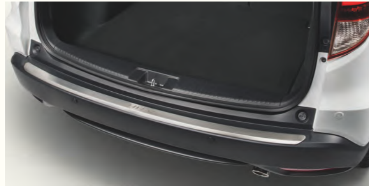
CARGO STEP PROTECTOR This item protects your car's bodywork from annoying scrapes and scratches when loading or unloading your boot.