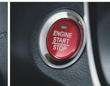
Smart Keyless Entry and Start