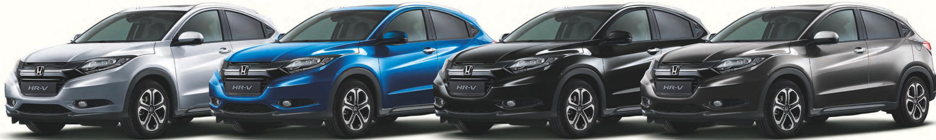
Alabaster Silver Metallic

A choice of colours that sound as good as they look. From Morpho Blue Pearl to Milano Red, there's the choice to match your personality perfectly.