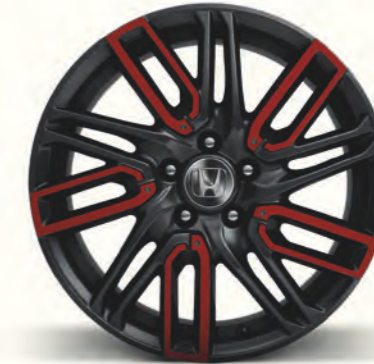
18" Ignis Alloy Wheel