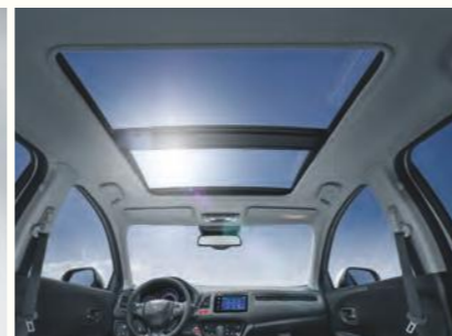
PANORAMIC OPENING GLASS ROOF