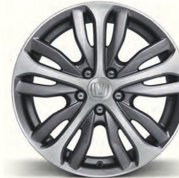
18" Potis Alloy Wheel