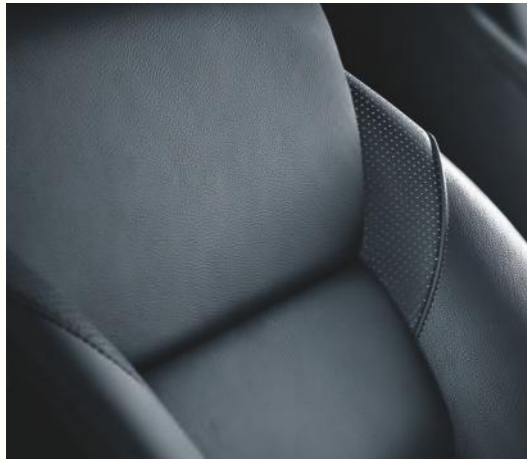
Leather interior only available on EX grade.

Whether it's smart fabric or premium leather, our upholstery means your HR-V won't just look great, it will feel great.