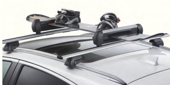
ROOF ATTACHMENTS Expand your car's carrying capacity with strong and secure cross bars or base carriers. Available attachments: Ski box Roof box Ski and snowboard attachment Bicycle roof attachment