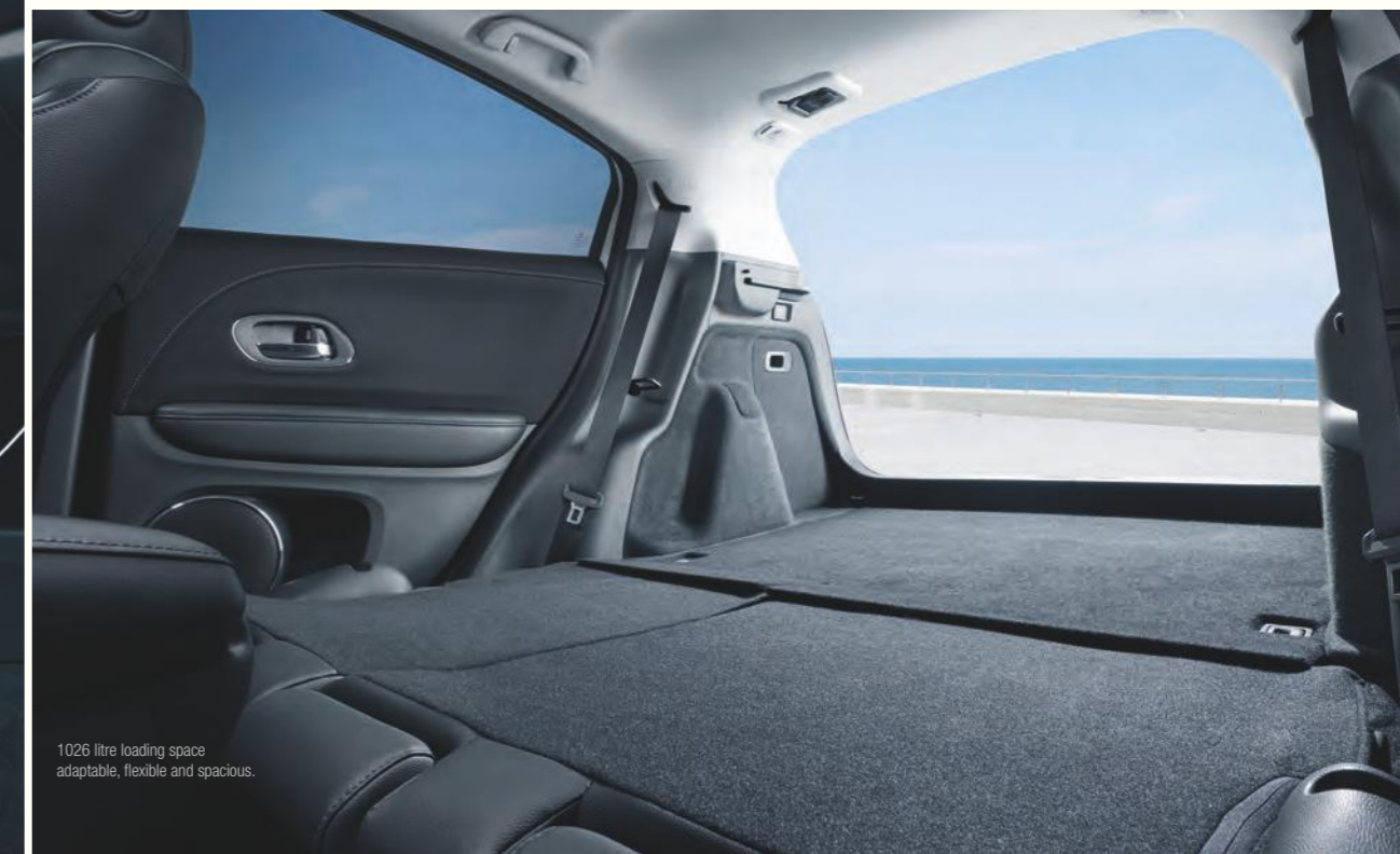
1026 litre loading space adaptable, flexible and spacious.

But it's not just the seats that are magical. The fact that the HR-V has the comfortable leg and headroom often found in larger cars, is quite a trick. The sense of space is further heightened by the opening panoramic glass roof*, allowing light and air in.