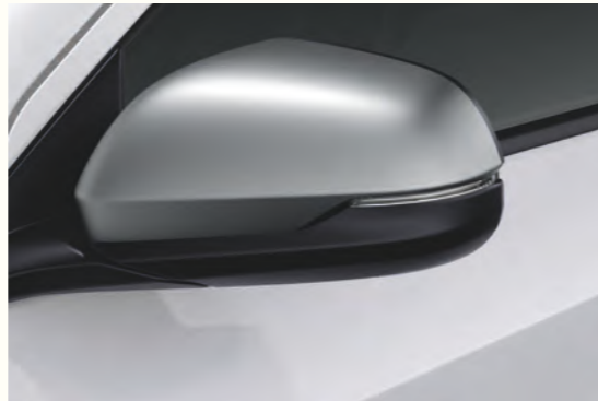
DOOR MIRROR COVERS Perfectly integrated exchange covers for side mirrors. They add an extra aesthetic touch. Available in matte silver and Milano Red.