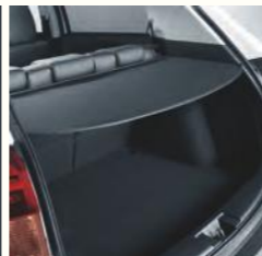
FLEXIBLE TONNEAU COVER