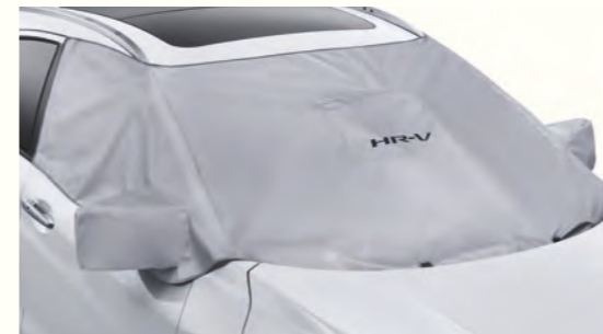
WINDSHIELD COVER Protect your car's windshield and mirrors from heavy weather when it's parked outside by applying the genuine windshield cover.