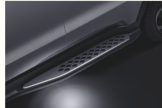
PUDDLE LIGHTS LED lights underneath the door sills on driver and passenger sides. For better visibility when entering and exiting your car.