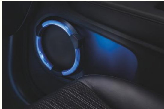
SPEAKER RING ILLUMINATION This accessory gives a modern and ambient atmosphere to the interior of the car.