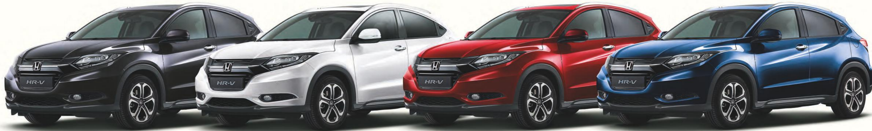
Ruse Black Metallic