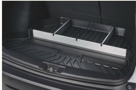
BOOT TRAY WITH DIVIDERS Perfectly formed to your car's boot shape, the waterproof, anti-slip boot tray with raised edges will protect the car's finish from dirt and scratches. Dividers are included.