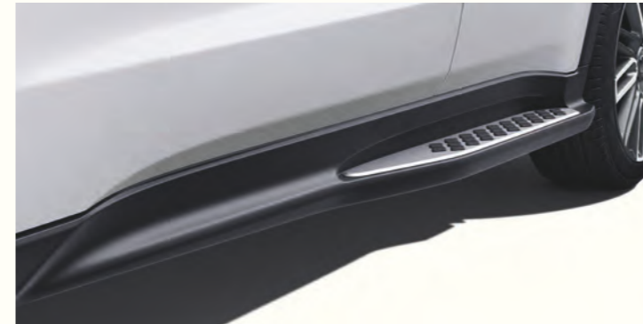
RUNNING BOARDS For easier entering and exiting of your car, these smoothly integrated running boards add design and functionality.