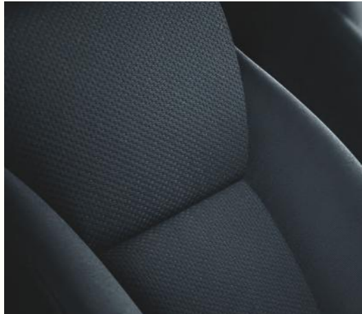
Fabric interior only available on SE and S grades.