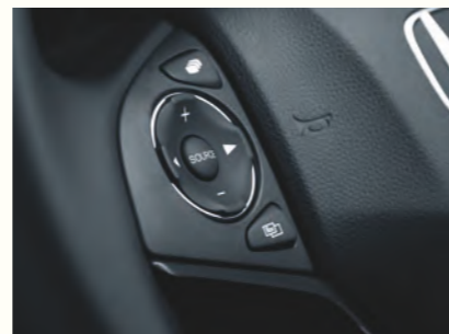
BLUETOOTH™ HANDS FREE TELEPHONE A

Honda CONNECT with Garmin navigation and CD player