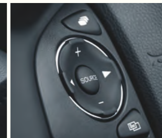
Steering Wheel Remote Audio Controls

Other features are also close at hand. Dual climate control means that it's not only you who's comfortable on a long journey, but also your passengers. Add electrically adjustable door mirrors, power windows and front heated seats* and you'll find sitting in the HR-V is something you could really warm to.