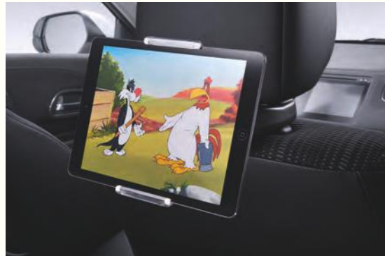
TABLET HOLDER To keep your passengers entertained, you can now also add our tablet holder. The holder's different positions offer you a comfortable space to watch a movie, read your e-mails or play games.